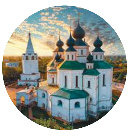
Take a day trip to the Cossak village Starocherkasskaya