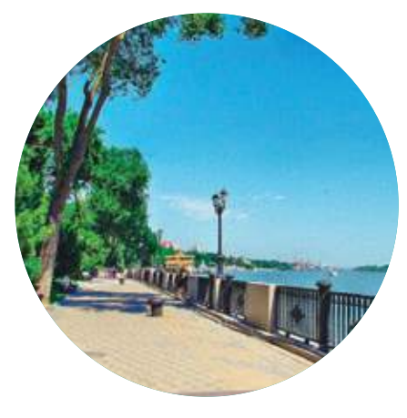
Rent an electric scooter and explore the Don embankment