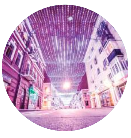
Take a walk along Soborny Lane on Christmas Eve