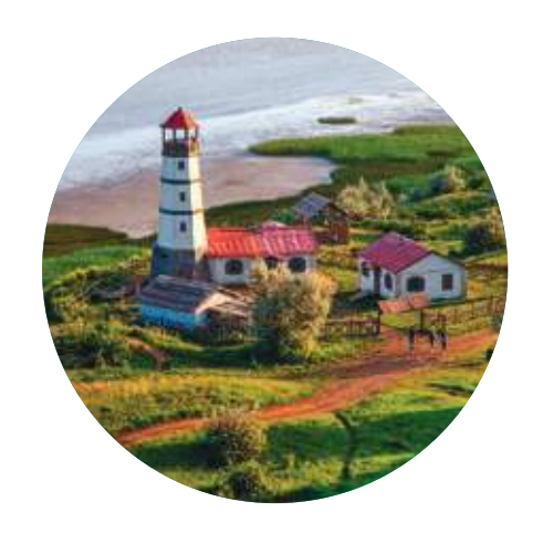
Take a picture at the lighthouse in Merzhanovo