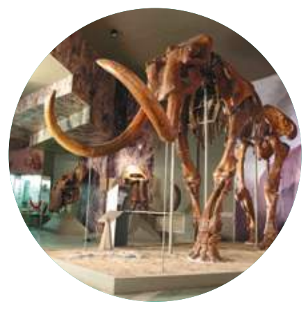
Visit the Azov Museum