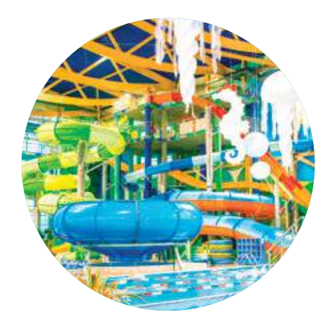
Enjoy a relaxing day at H2O Waterpark