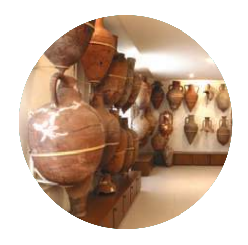
Take a walking tour around the ancient city of Tanais