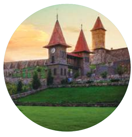
↑ Visit Logo Park