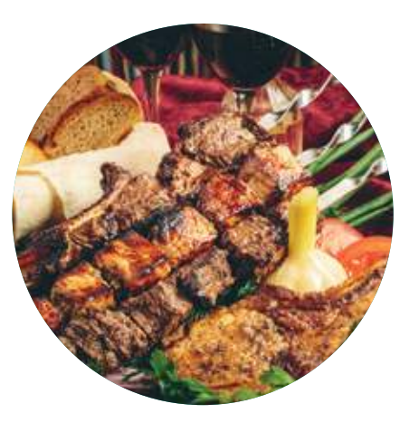
Try Caucasian cuisine