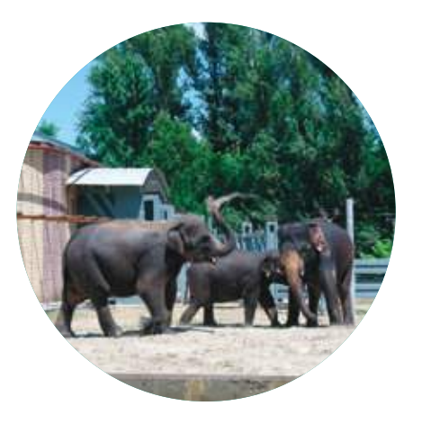
Visit Rostov Zoo