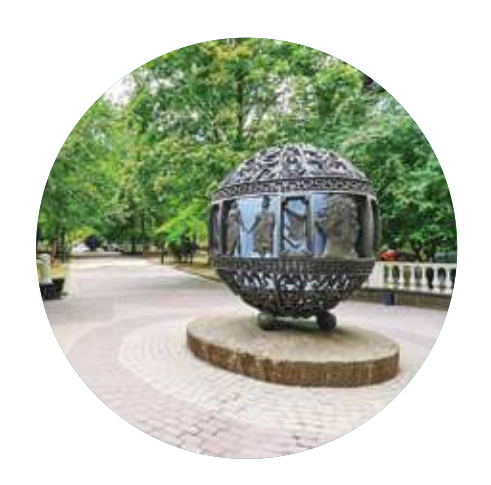
Take a stroll down Pushkinskaya – Rostov's most vibrant and cultural street